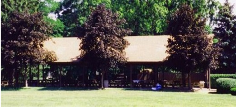
Walnut Grove Pavilion - Burgundy Basin Inn